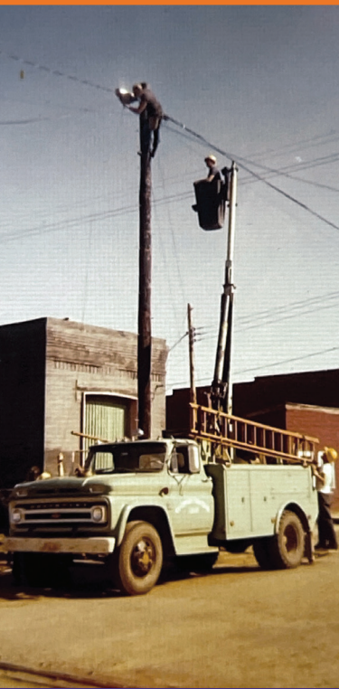
MCTC construction photos, circa 1960s.